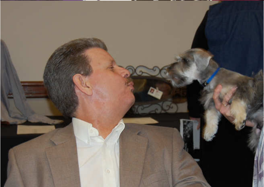
2008—The Mystique of Red Oak attendees.

The Chamber would like to take this opportunity to Thank each and every one that volunteered to help. We could not do it without you.