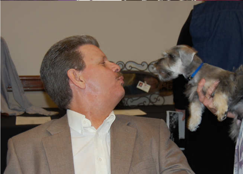
2008—The Mystique of Red Oak attendees.

The Chamber would like to take this opportunity to Thank each and every one that volunteered to help. We could not do it without you.